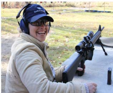
Fun with the AR-223